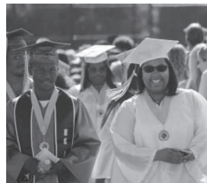
We are proud to announce a 97% graduation rate for the Class of 2017.