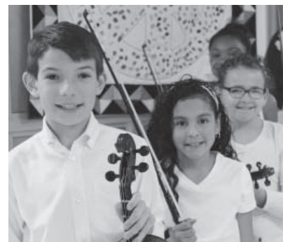
For the ninth year, Longwood was named a "Best Community for Music Education" by the National Association of Music Merchants Foundation.