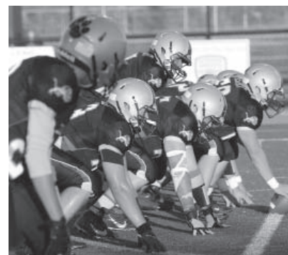
Our varsity teams qualify for the NYSPHSAA Scholar-Athlete Team Award by maintaining an academic average of 90 or above.

For a complete list of projects, visit our website at www.longwood.k12.ny.us .